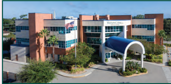
Bella Vista Building - 3 rd Floor 1755 N. Florida Ave. • Lakeland, FL 33805