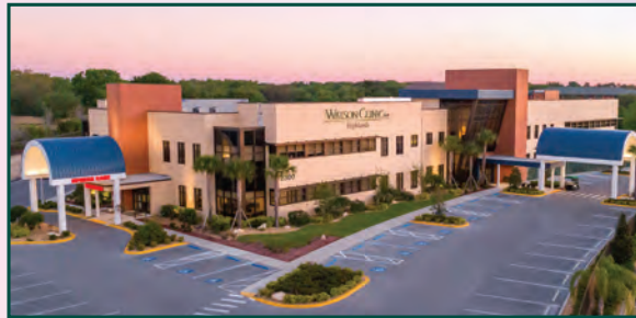
Highlands - 2 nd Floor 2300 E. County Road 540A • Lakeland, FL 33813