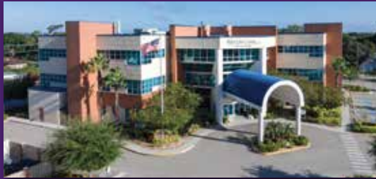
Watson Clinic Bella Vista Building 1755 N. Florida Avenue Lakeland, FL 33805