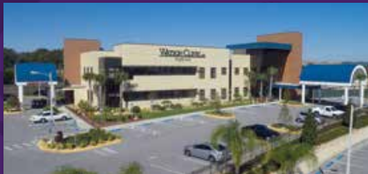
Watson Clinic Highlands 2300 E. County Road 540A Lakeland, FL 33813

Call 863-904-6231 for an appointment today!