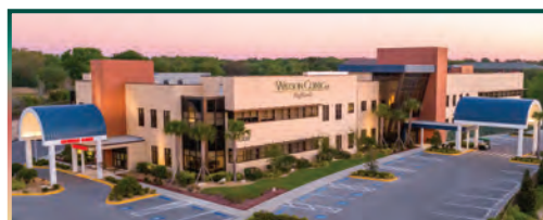
Watson Clinic Highlands 2300 E. County Road 540A • Lakeland