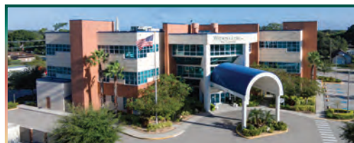
Watson Clinic Bella Vista Building 1755 N. Florida Ave. • Lakeland

To schedule an appointment with an OB-GYN physician, please call 863-680-7243 .