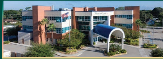
WATSON CLINIC BELLA VISTA BUILDING 1755 N. Florida Ave. · 1 st Floor · Lakeland