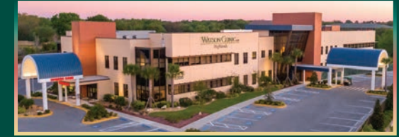
WATSON CLINIC HIGHLANDS 2300 E. County Rd. 540A · 1 st Floor · Lakeland