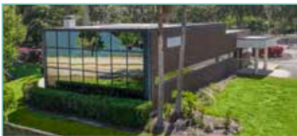
Orthopaedics at Winter Haven