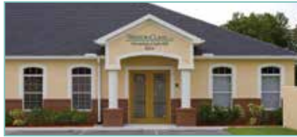
Dermatology at Zephyrhills