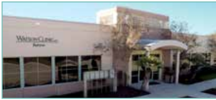
Bartow Building A