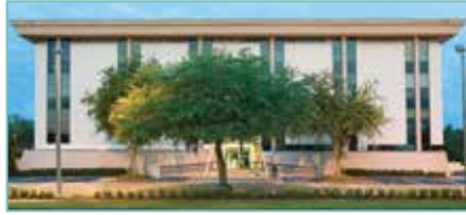
Center for Rehabilitative Medicine