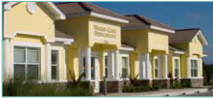
Dermatology at Sun City Center