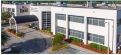
Cancer & Research Center