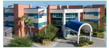
Bella Vista Building