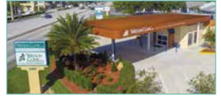
Center for Specialized Rehabilitation