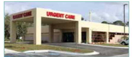
Urgent Care South