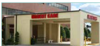
Urgent Care Main