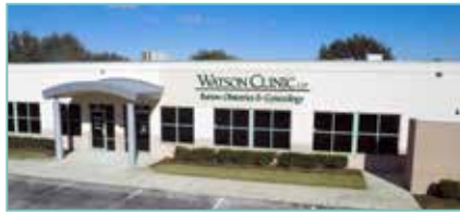
Bartow Building B