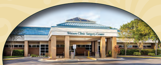
Watson Clinic Surgery Center 1315 N. Florida Avenue | Lakeland, FL 33805

WATSON CLINIC Call 863-904-6231 for an appointment today.