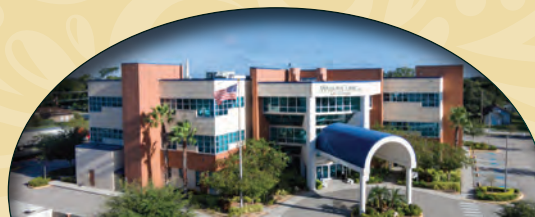
Watson Clinic Bella Vista Building 1755 N. Florida Avenue | Lakeland, FL 33805