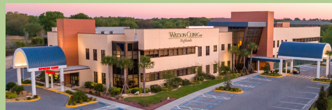
Watson Clinic Highlands

2300 E. County Road 540A. | Lakeland, FL 33813