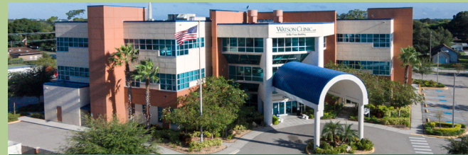
Watson Clinic Bella Vista Building 1755 N. Florida Ave. | Lakeland, FL 33805